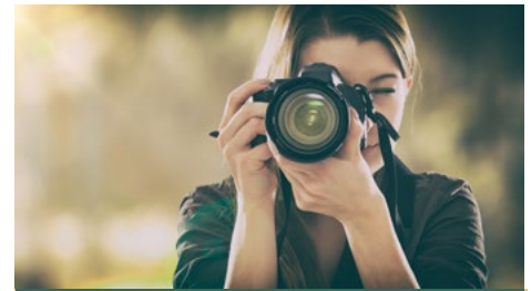
Photo Ministry Interest Meeting

The Hunter Street Photo Ministry is a group of volunteers who offer their time and photography skills to capture moments at special services and events that showcase church life here at Hunter Street. If you are a church member, high school age and older, who enjoys doing event photography and would like to serve within this ministry, we are holding a Photo Ministry Interest Meeting on Sunday, March 17, 10:30am, in the Small Conference Room across from the Chapel. Please come for a brief meeting to go over service opportunities and hear more about how you can become a Photo Ministry volunteer.